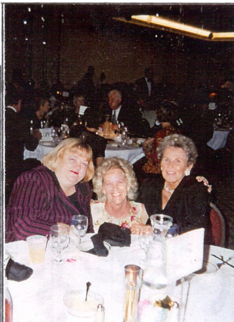
30th Anniversary Gala at the Charleston Club, Orientation Flight on the C-17

As you can see, your alumni members and officers have been busy working on your behalf. The 315th Airlift Wing Alumni Association officers and members are dedicated to increasing membership, planning a variety of activities, and making your association the best since the alumni was organized. Those goals were achieved with the help and support of all our alumnus and associates. Last year, we asked your response to quarterly alumni lunch meetings, "Alumnus of the Year" award, and establishing area representatives. The majority voted for this.